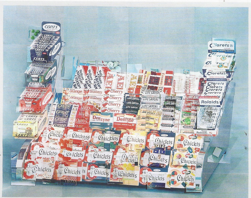
No. 64 CONS. H. 8 ¼" W. 24" D. 16 ½"