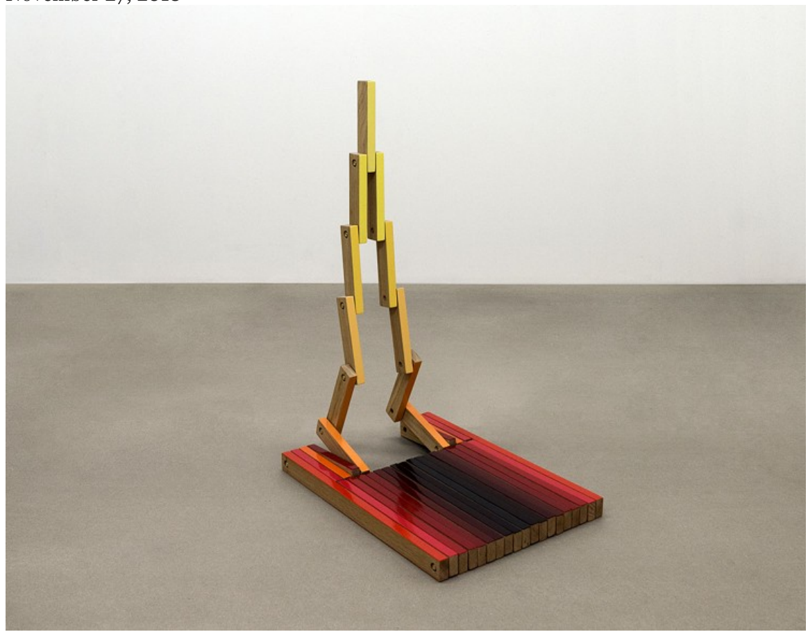
Reuven Israel, Untitled Folding Object 36A (2018), oak, paint and brass hardware, 15½ inches wide, height and depth variable

Part Jenga, part Transformers, and pretty funny in a post-structuralist art theory kind of way, Reuven Israel's new exhibition of modular sculptures for wall and floor at Shulamit Nazarian presents itself, as the title indicates, in segments. In Four Acts is composed of singular works that arrive flat but soon rearrange themselves into a potentially infinite series of expanding and contracting sculptural configurations.