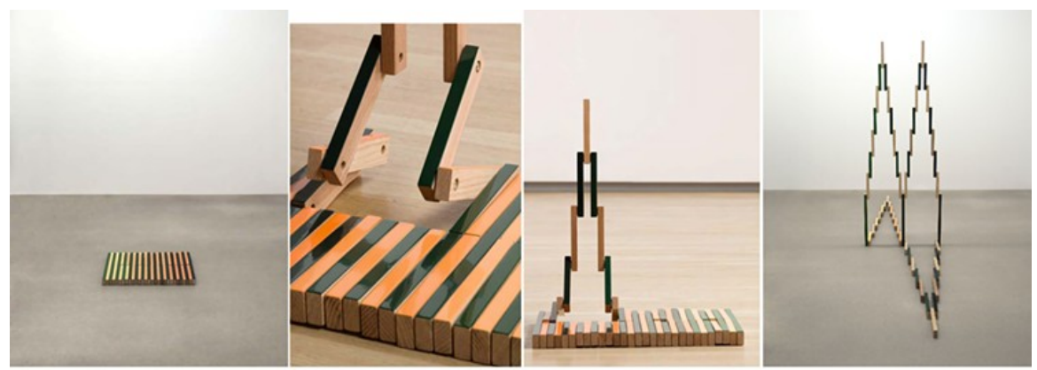
Reuven Israel, Untitled\ Folding\ Object\ 55A (2018), oak, paint and brass hardware, 23^{1/2} inches wide, height and depth variable

In carefully planned behind-the-scenes setups, the dozen or so sculptures of various sizes and color schemes will, every two weeks, shift their shapes (not placements) to a new position. In this way, what started in Act 1 when the show opened on Nov. 3, changed to Act 2 on about Nov. 20, and will change to Act 3 on or about Dec. 4, before its final placements for the last week of the show, which closes Dec. 20.