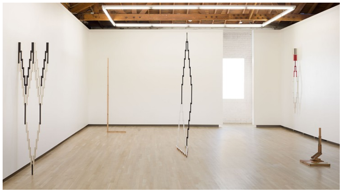
Reuven Israel, In Four Acts , installation view

Aside from becoming incrementally more elaborate with each act, and the illusions and surprises of each one's color story becoming more manifest, the movements of the ones creates an entirely new installation landscape across the gallery, as the overlapping sightlines and other visual and physical intersections unfold (pardon the pun) into a fresh choreography. The scale of these works is keyed to the human body, so that not only due to the look of an old-school toy but also because of the scale, mimicking or modifying their movements is easy to imagine.