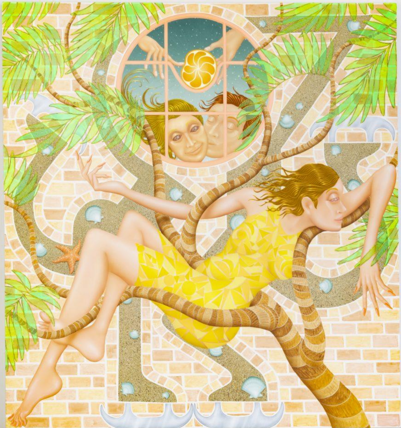
Wendell Gladstone, Breezy (2021).