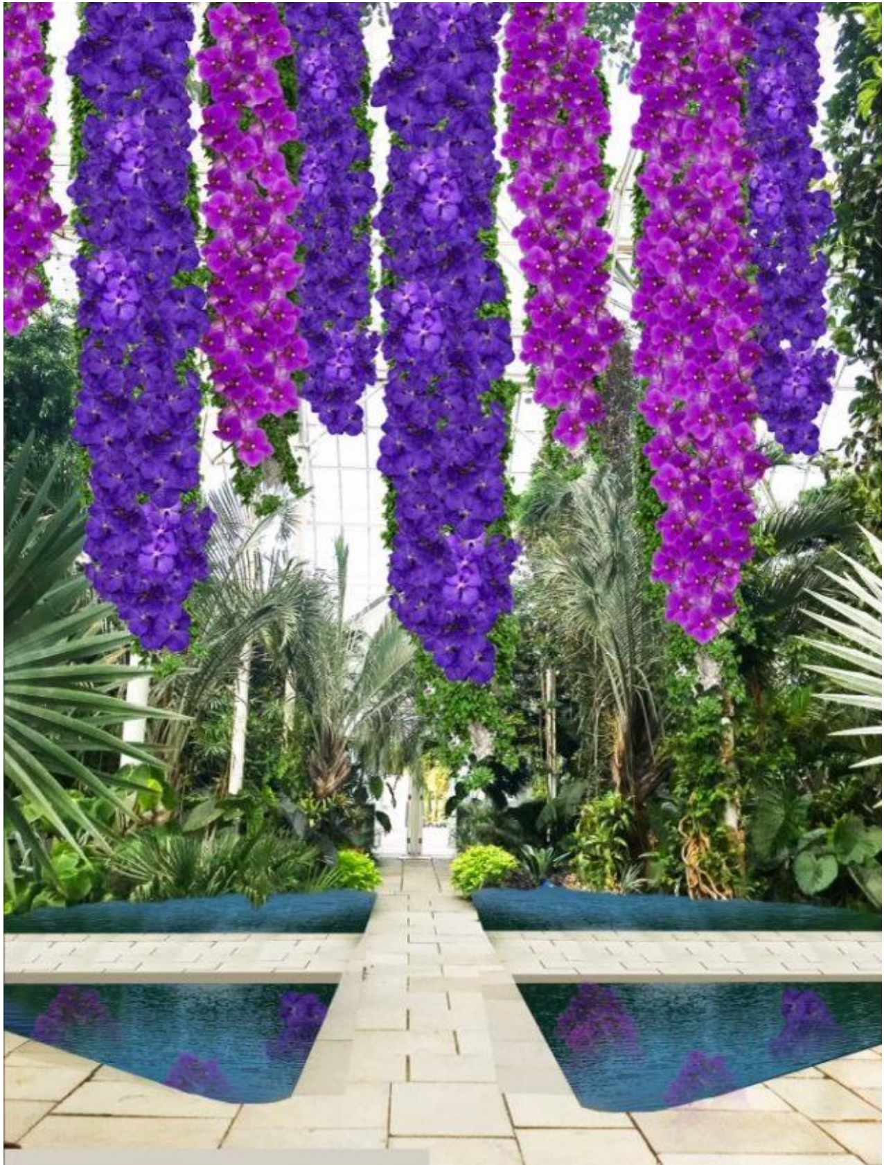
Rendering of “The Orchid Show: Jeff Leatham’s Kaleidoscope” at the New York Botanical Garden.