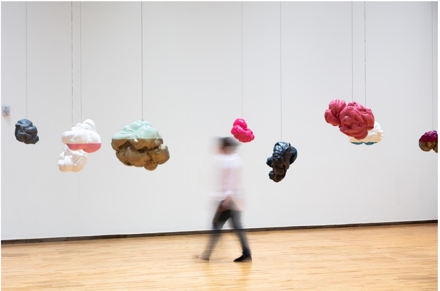
Kim Faler, Double Bubble (2020).