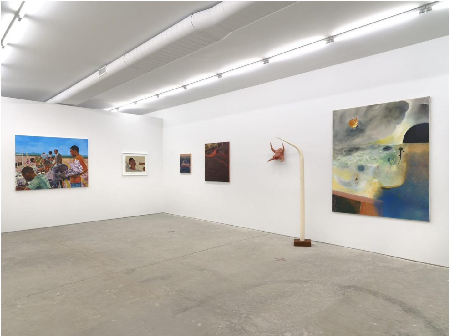
Installation view, “Pa’l Patio”, 2022.