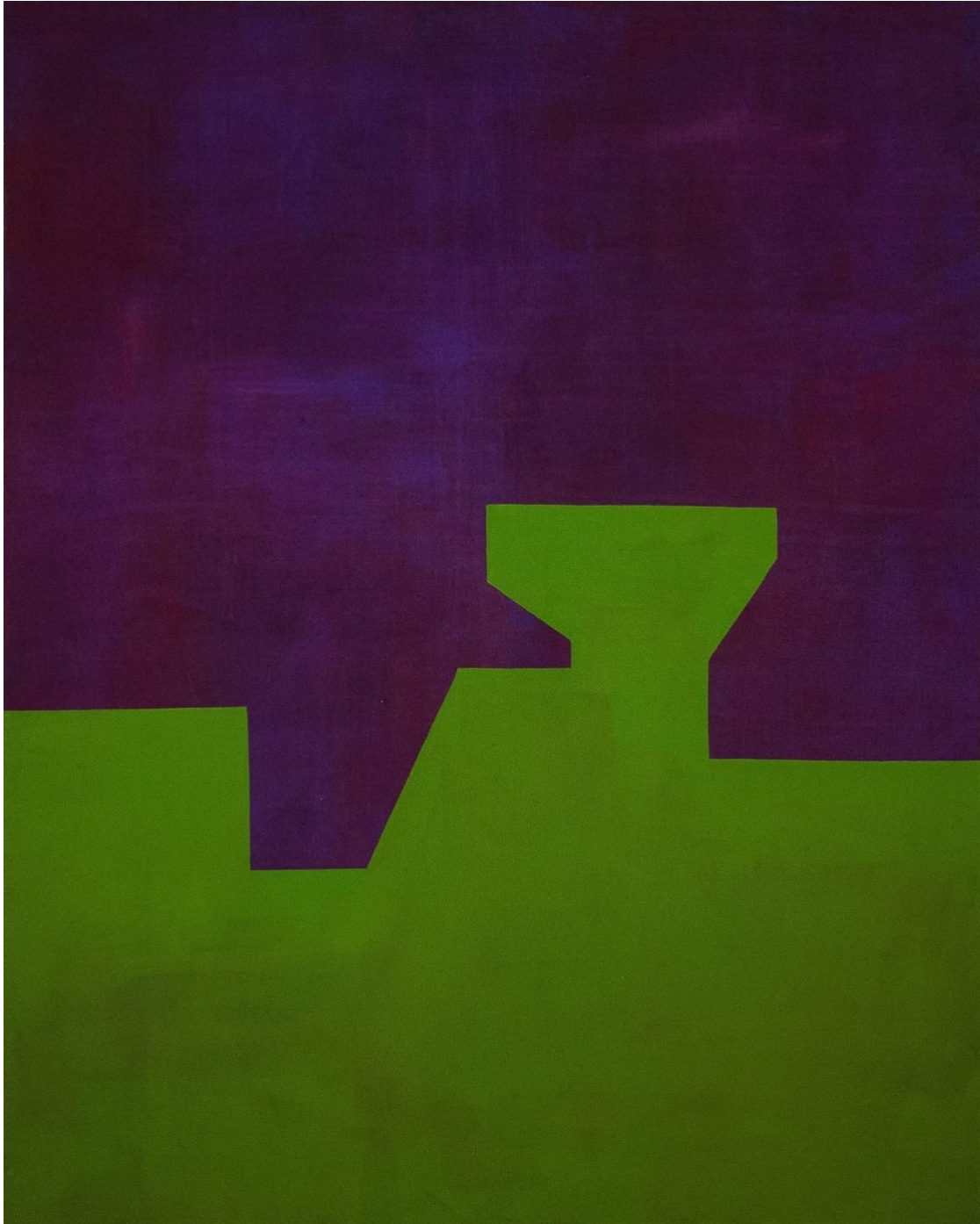
Liv Mette Larsen, Vertical Nightview III (2018).

Anders Wahlstedt Fine Art presents a solo exhibition of 19 paintings by Norwegian artist Liv Mette Larsen. Each painting is a color-block composition of two hues reminiscent of a city silhouette at night. Works on paper by the artist are also on view in the back room.