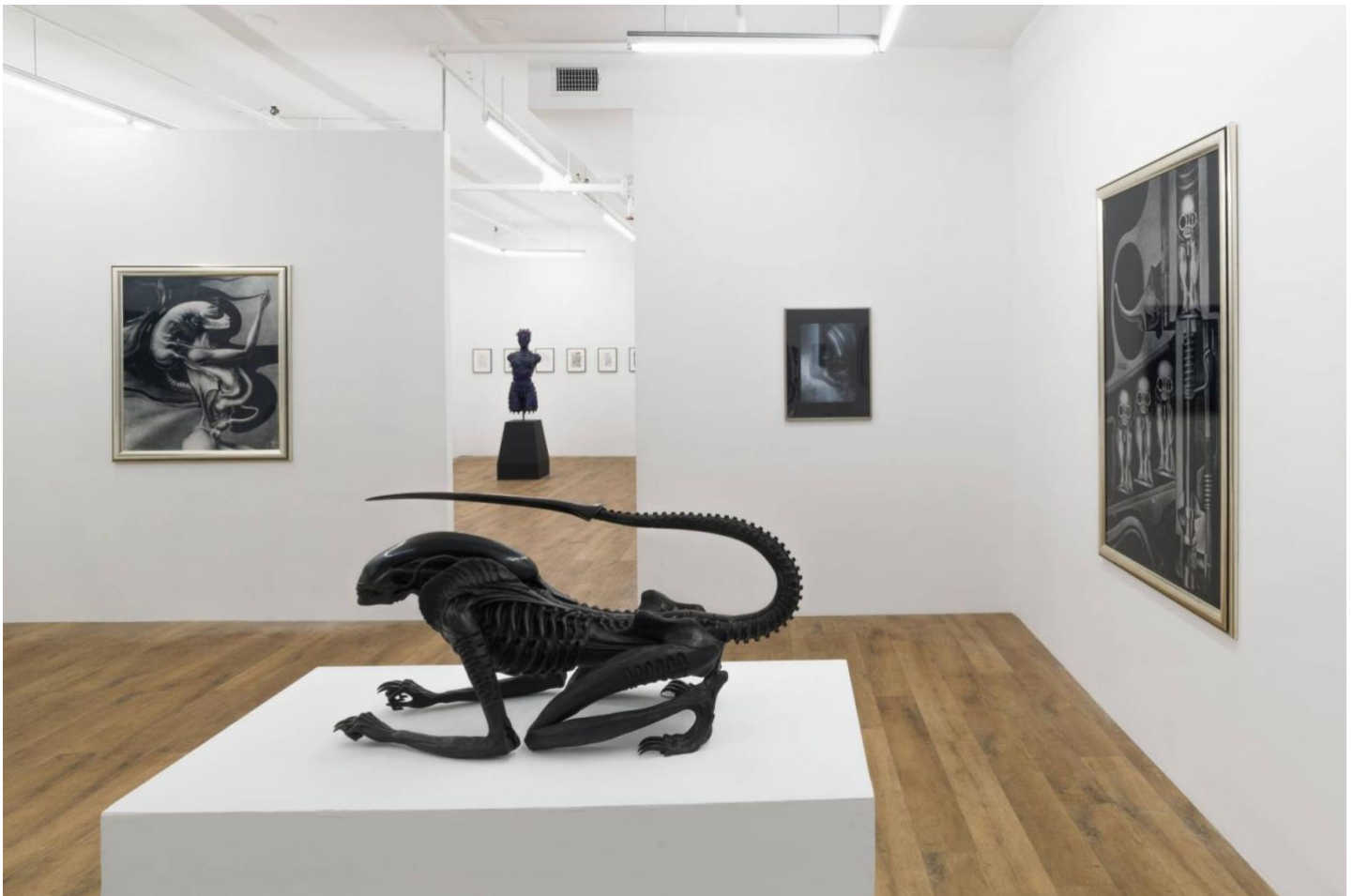
Installation view, “H.R. Giger: HRGNYC,” at Lomex, New York.